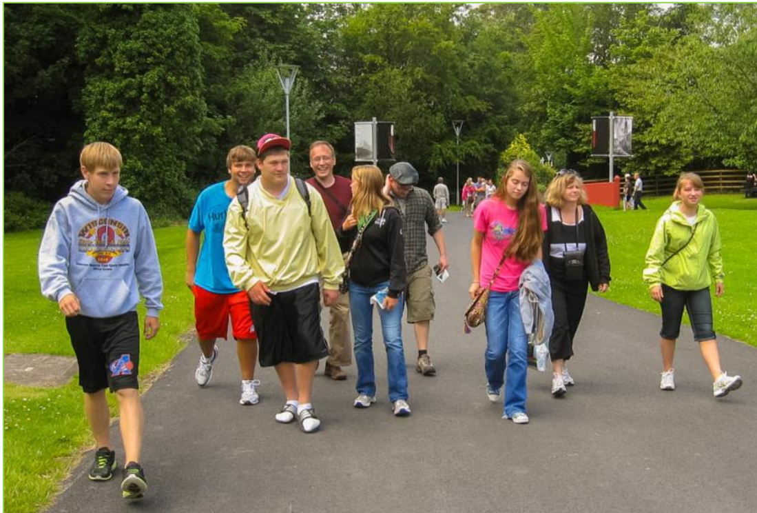
Part of the Bethany team after touring a museum

Irish acquaintances remarked that while too much distrust and hatred still exists on both sides, peacemaking efforts do exist, giving them hope for future generations!