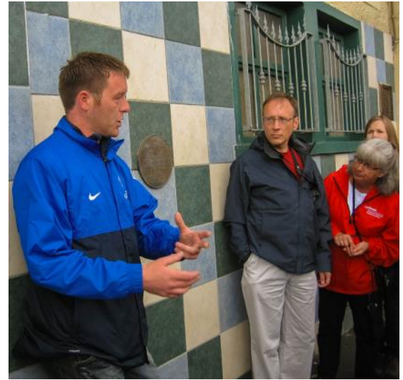
Right: Protestant Neighborhood tour describing the violence and conflicts they endured.