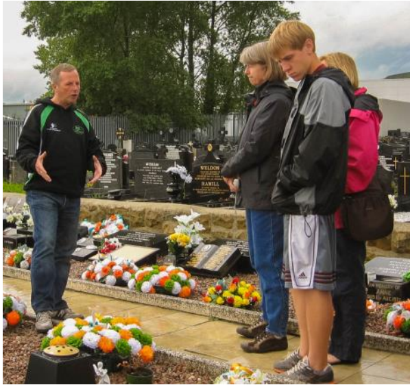
Left: Catholic Neighborhood tour telling about those who lost their lives during the Troubles.