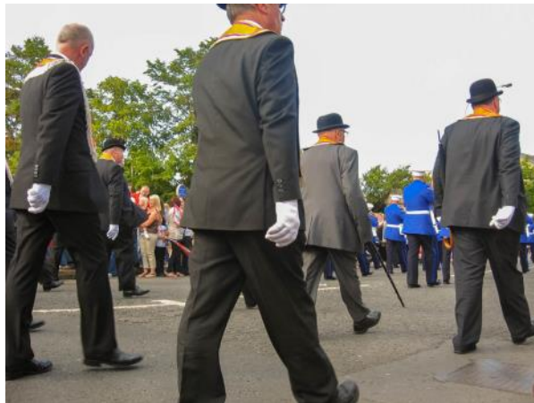
Twelfth Day Parade — Orange Order Lodge members