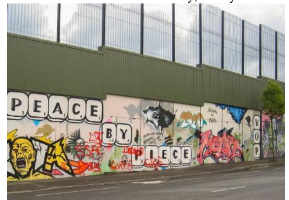
"Peace Wall" built by the British to separate the two feuding neighborhoods

The couple explained that the recent uprisings are associated with Great Britain's exit from the European Union which became official on December 31, 2020. Prior to that, because Northern Ireland and the Republic of Ireland were both in the European Union, there were no barriers at the border between the two countries and travelers and trade could flow freely. That has now changed because Northern Ireland is no longer a member of the European Union. Both sides are dissatisfied. They have serious disagreements with each other and Great Britain about the travel barriers at the border, tariffs on goods being transported, what to do about immigrants and whether or not they are getting a fair deal economically.