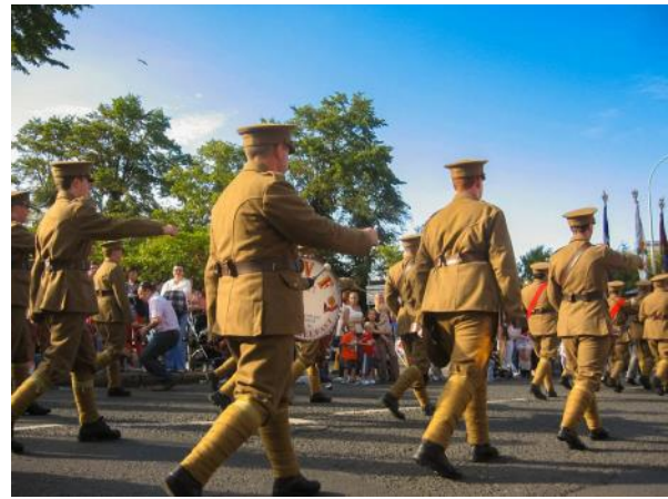
Twelfth Day Parade — Marchers in WW1 uniforms