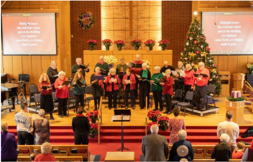
Left: On December 18th we enjoyed the Chancel Choir singing our Christmas Cantata, Rejoicing in Love .

Our Longest Night Service provided an opportunity for people to pray for one another as they acknowledged that for many people, Christmas is a time of loneliness, sorrow, alienation, and sadness. The service offered a way for people to claim those feelings and still feel surrounded by the compassionate love of God.