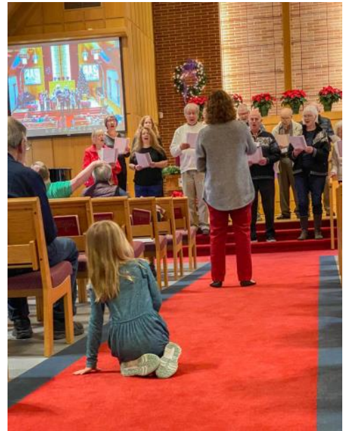
Enjoying the Sunday Anthem