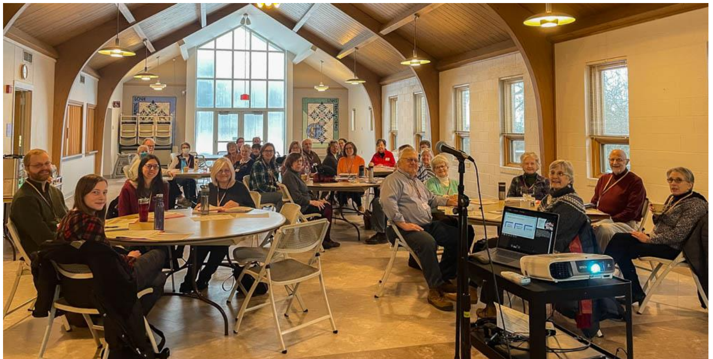
Leadership Workshop Gathering