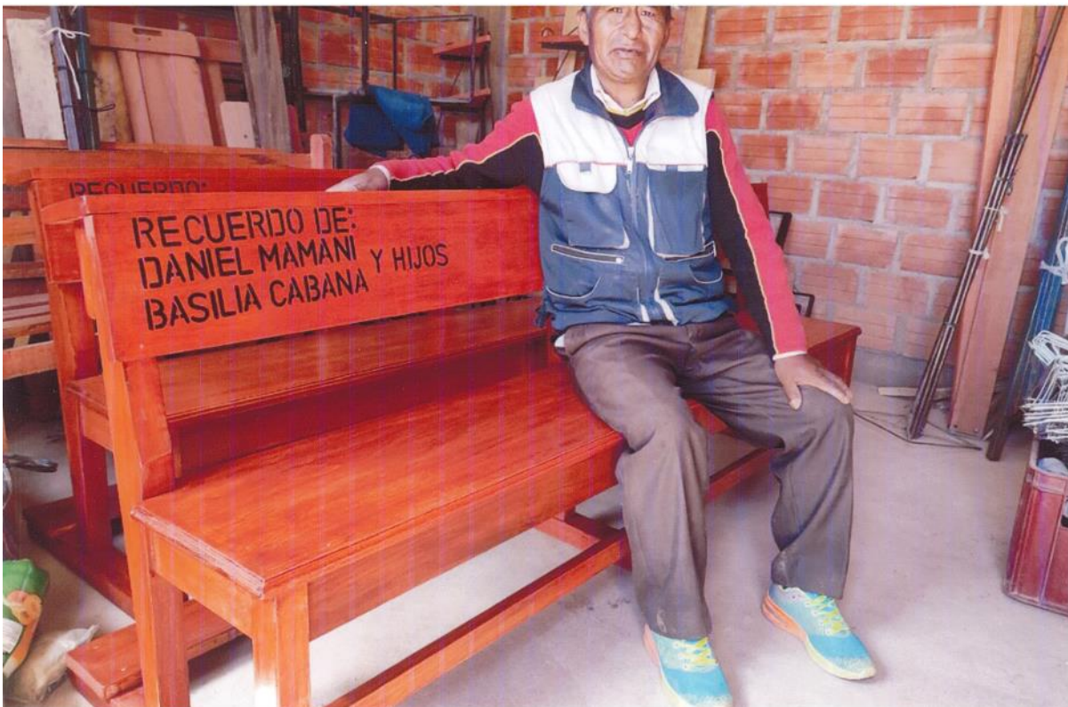
A sample of the kind of pew that will be made for the Bolivian congregation.

Up next: Simple gifts for April will support Wisconsin Faith Voices for Justice.