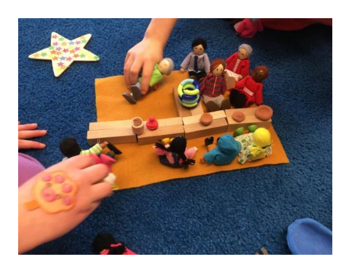
The Last Supper