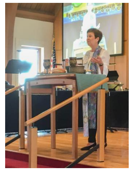
New communion table