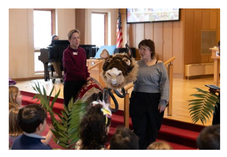
The donkey made an appearance and helped lead the Parade of Palms