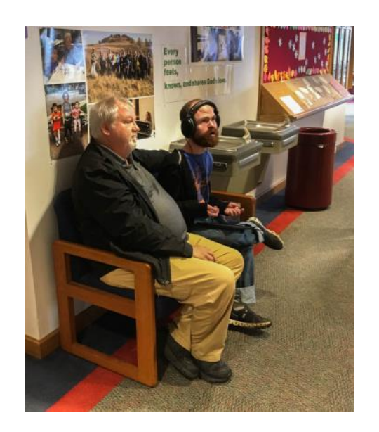
In the Lobby during worship