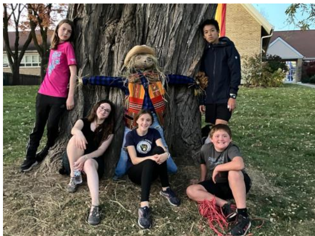
On Sunday, Oct. 20th Bethany's Youth Group went to Schuster's Farm. It was an epic adventure filled with connecting, shenanigans, treats and pumpkins.